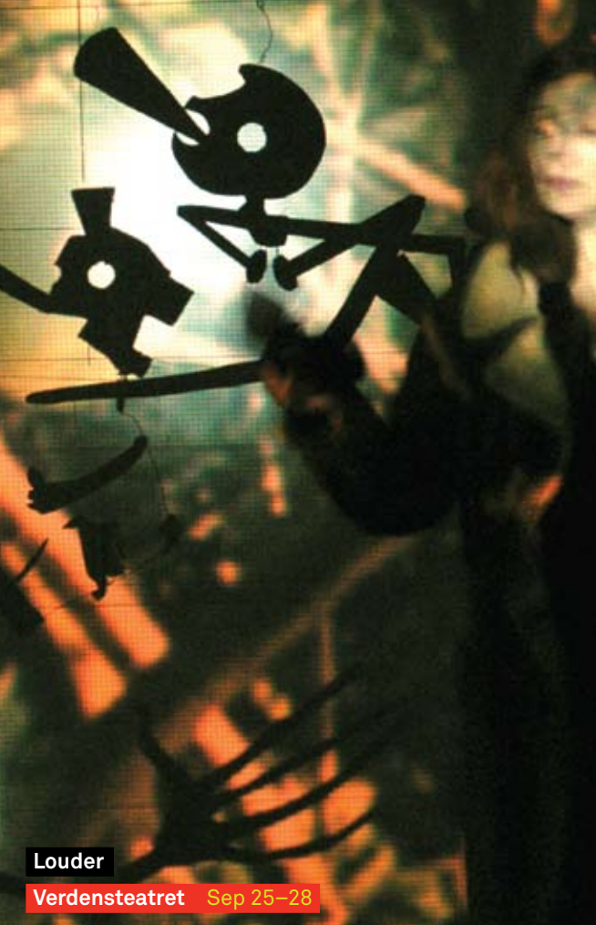
Louder Verdensteatret Sep 25-28