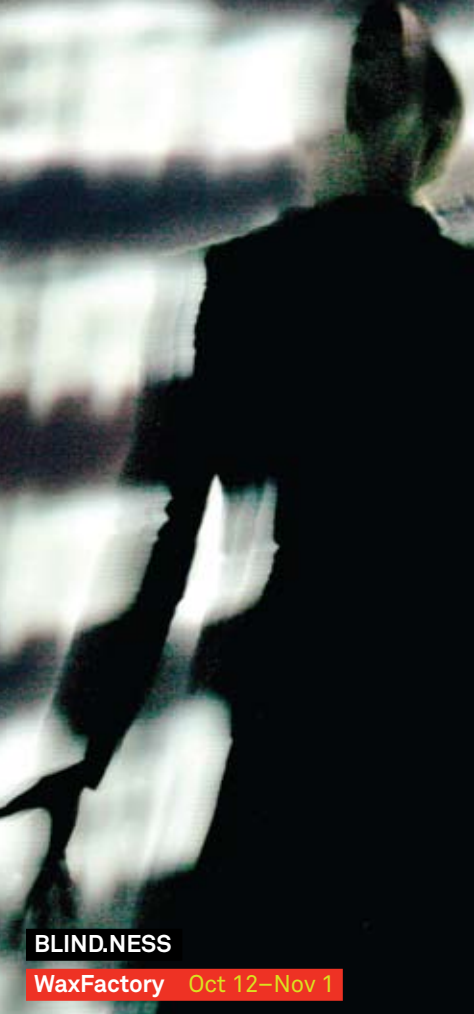
BLIND.NESS WaxFactory Oct 12-Nov 1