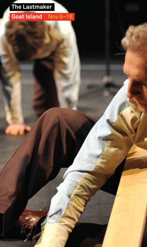
The Lastmaker Goat Island Nov 6-16