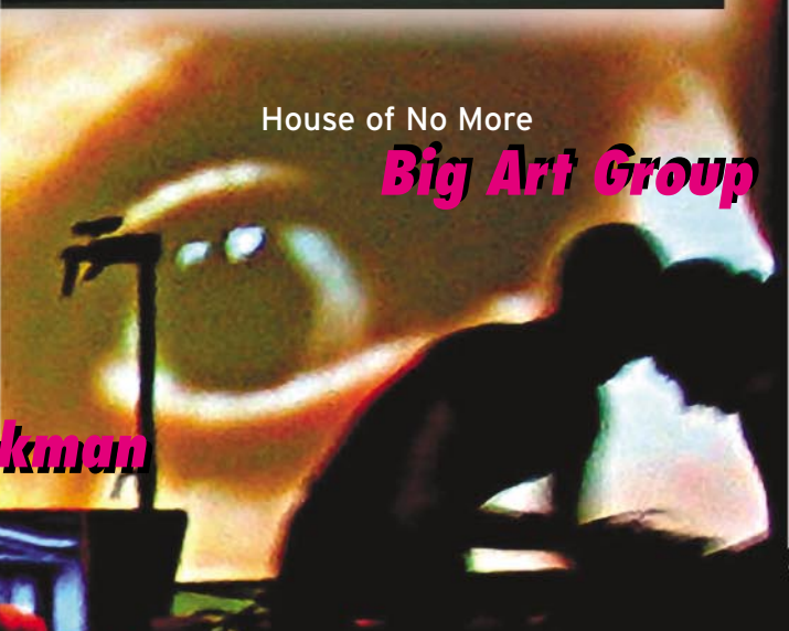
House of No More Big Art Group