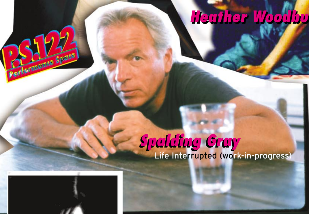
Spalding Gray Life Interrupted (work-in-progress)