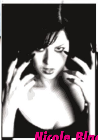
Nicole Blackman Courtesan Tales